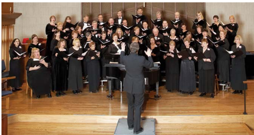
NEPONSET CHORAL SOCIETY SPRING 2008